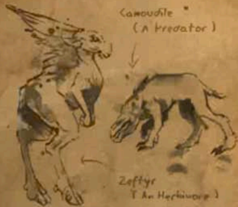
Camoude (A Predator)