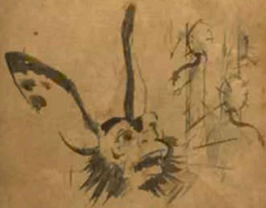
Mangrer (An Omnivore)

slice-n-dice, but it let out this ear-piercing shriek. Must have been a signal to its buddies 'cause they all took off into their nests. Too bad Mister Shrieker wasn't fast enough